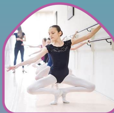
Grand Pliés - 5 times