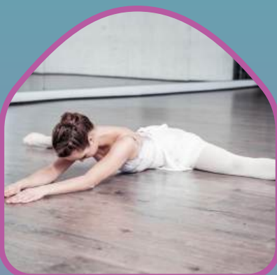
Split - 1 minute