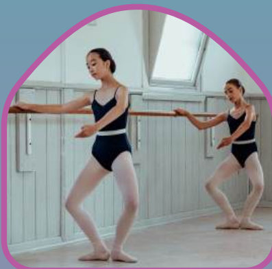
Demi - Pliés - 10 times