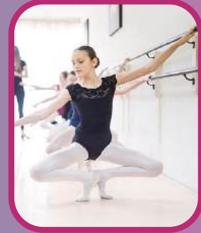
Grand Pliés - 5 times