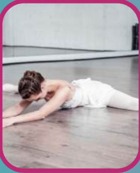
Split - 1 minute