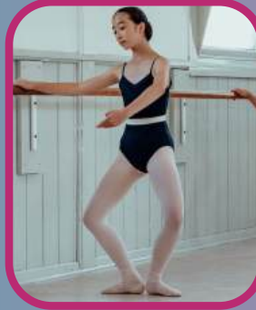
Demi - Pliés - 10 times